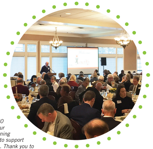
This past fall, over 220 supporters attended our Leaders for Early Learning fundraising breakfast to support Think Small's mission. Thank you to everyone who attended and made the event an enormous success!